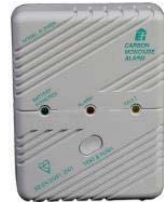
Wireless Carbon Monoxide Alarm