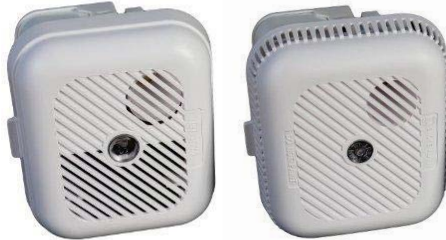
Wireless Optical & Ionisation smoke alarm option