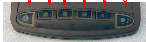
Minute Advance Hour Advance Alarm On/Off