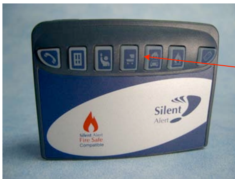
Sure-key™ Interactive Keypad

Part of the SA3000 Paging System for deaf and deaf-blind people