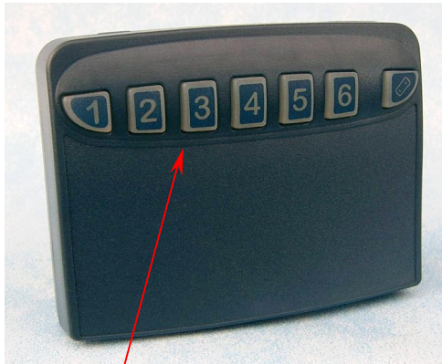
Sure-key Interactive Keypad

Part of the SA3000 Care Call Paging System